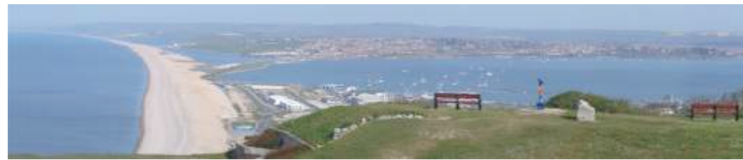
Panoramic image by Bob Ford